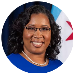
MELISSA CONYEARS-ERVIN Treasurer City of Chicago